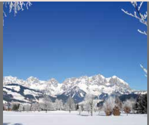
Kaisersuiten . Kirzbühel

Publisher Nymphenburger Beteiligungs AG Nymphenburger Straße 4, 80335 Munich Phone +49 (0)89-552 50 30, Fax: +49 (0)89-550 26 56 info@optima-firmengruppe.de