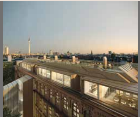
Opernlofts . Berlin