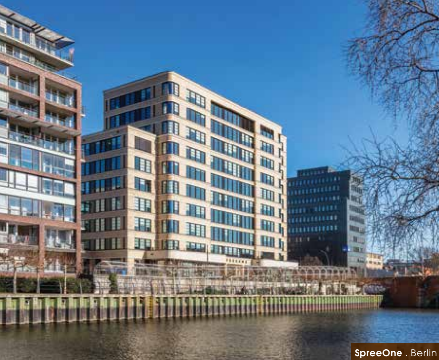
SpreeOne . Berlin