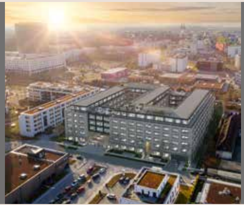
south Horizon . Munich