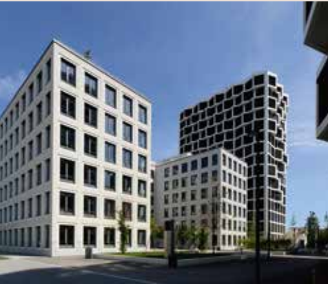
Vital Office @ Hirschgarten . Munich