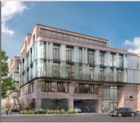
New Eastside . Munich