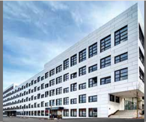
Atelier an der Medienbrücke . Munich