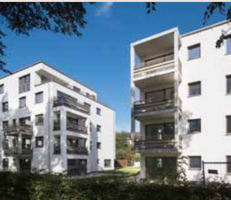
INBALANCE . Munich