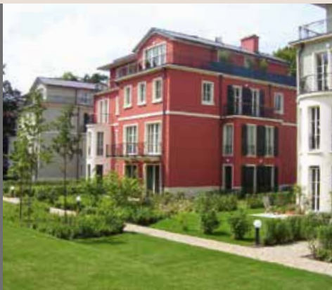
Humboldt Palais . Berlin