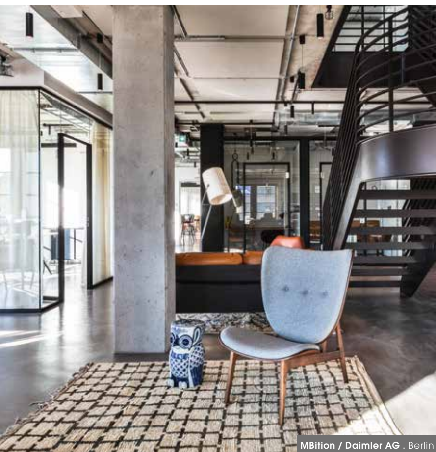
Berlin

AEW AMUNDI BLACKSTONE BNP PARIBAS GENERALI LASALLE INVESTMENT MORGAN STANLEY REALIS SOCIÉTÉ GÉNÉRALE TAEKKER GROUP ZAPHIR GROUP