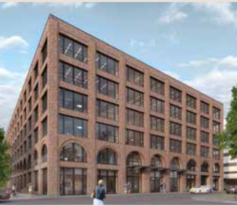
MB - work & create . Munich