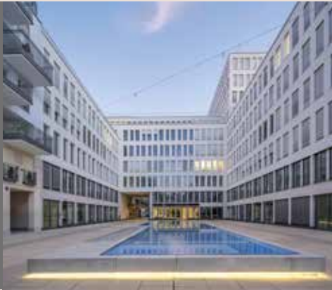
Nymphenburger Höfe . Munich