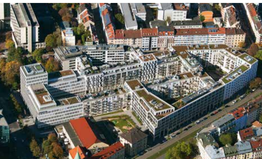
Nymphenburger Höfe . Munich

ADESSO · ALDI · BRAINLOOP BUNDESBANK · BEATE UHSE · CMS DAIMLER AG · DEAN & DAVID · EDEKA FLIXBUS · GRUNER & JAHR · HARK IQUOS · JUNIPER NETWORKS · KIK LANDESHAUPTSTADT MÜNCHEN LANDRATSAMT · MAN · MC FIT OLDENBOURG VERLAG PRO7 / JOCHEN SCHWEIZER REGUS · REWE · ROTES KREUZ SPRINGER VERLAG · TERADATA THINK PROJECT · UNICREDIT / MOBILITY WTS · AND MANY MORE